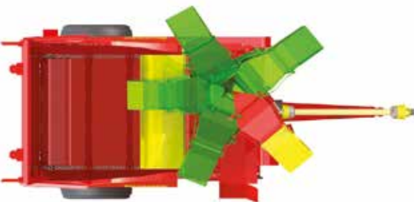
Swivel chute with 280° rotation