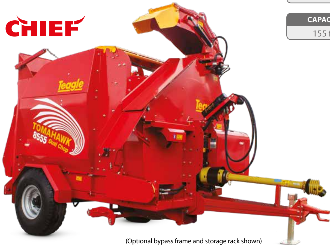
(Optional bypass frame and storage rack shown)