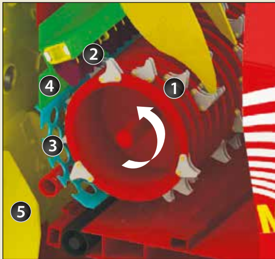
'Dual Chop' mechanism in short chop position

The 'Dual Chop' system incorporates a set of retractable blades that can be repositioned at the touch of a button, changing straw output from short chop (around 1½") to no chop, and back again when desired in a matter of seconds.